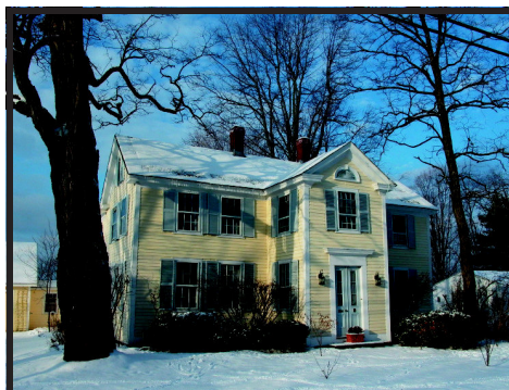
The Currier House 1815—1835

Welcome to Canaan's beautiful historic district and our friendly neighborhood.