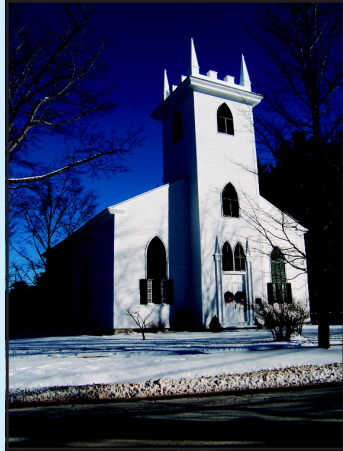
Old North Church 1828

Canaan Historic District Commission 603.523.4501 www.townofcanaannh.us